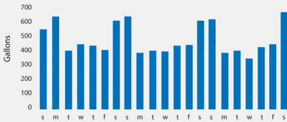
Water Usage - Previous 21 Days