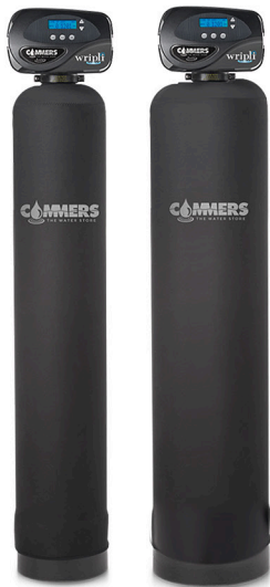
50 W.E.T. 75 W.E.T