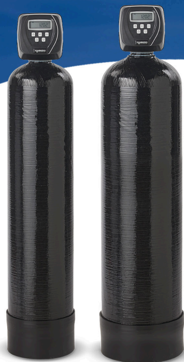
50 HE Series