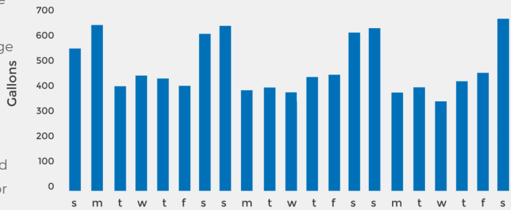
Water Usage - Previous 21 Days

The Commers High Efficiency Series offers years of trouble free performance on even the hardest of water. The system's patented microprocessor keeps a running average of the previous 21 days' water usage and automatically adjusts the conditioned water reserved higher or lower as required, ensuring you quality water when you need it. And with soft water brining keeping internal parts vital to the proper operation of the system free from the wear and tear of hard water, you'll enjoy the benefits of soft water for many years to come!